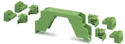
Illustration shows different articles for putting together the upper part of the housing

http://eshop.phoenixcontact.de/phoenix/treeViewClick.do?UID=1861028